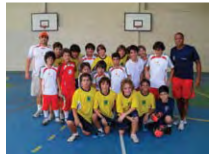
St Nicholas 10 x 2 Escola Cidade Jardins Play Pen (Girls)